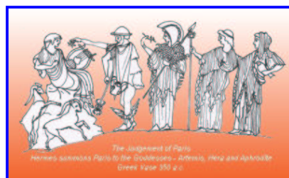
Paris and the three goddesses

Venus/Aphrodite was indirectly the cause of the Trojan War. It started with a contest. The aim was to name the most beautiful goddess. The choice was narrowed down to three: Juno, Pallas Athena and Aphrodite. Godfather Zeus was chosen to decide and wisely declined, suggesting they ask a young shepherd, Paris, who he assured them, would be a fair judge. Paris was not asked to look at the goddesses, but to choose the fairest by judging which of their gifts he would accept. Juno offered to make him the ruler of Europe and Asia; Pallas Athena assured him he would lead the Trojans to victory over the Greeks; and Aphrodite offered him the fairest woman in the world. He gave the golden apple of choice to Aphrodite and the goddess led him to Helen of Troy, the wife of Menelaus. Her abduction was the cause of the Trojan War.