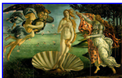
Birth of Venus by Sandro Botticelli (1485-86)