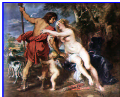
Venus and Adonis

Another important figure in the mythology of Aphrodite is Adonis. Smyrna, the daughter of King Cinyras of Cyprus, was rumoured to be more beautiful than Aphrodite/Venus. Cinyras's wife bragged of her daughter's beauty and aroused the goddess' vengeful nature. Venus caused a spell to fall on Smyrna who then fell in love with her own father, went to him while he was in a drunken stupor and became pregnant by him. When Cinyras found out what happened, he pursued Smyrna to kill her and as he raised his sword to strike her, Aphrodite turned her into a myrrh tree. The tree was sliced in two and out fell Adonis.