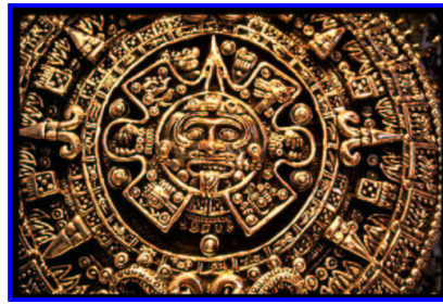
The Aztec calendar